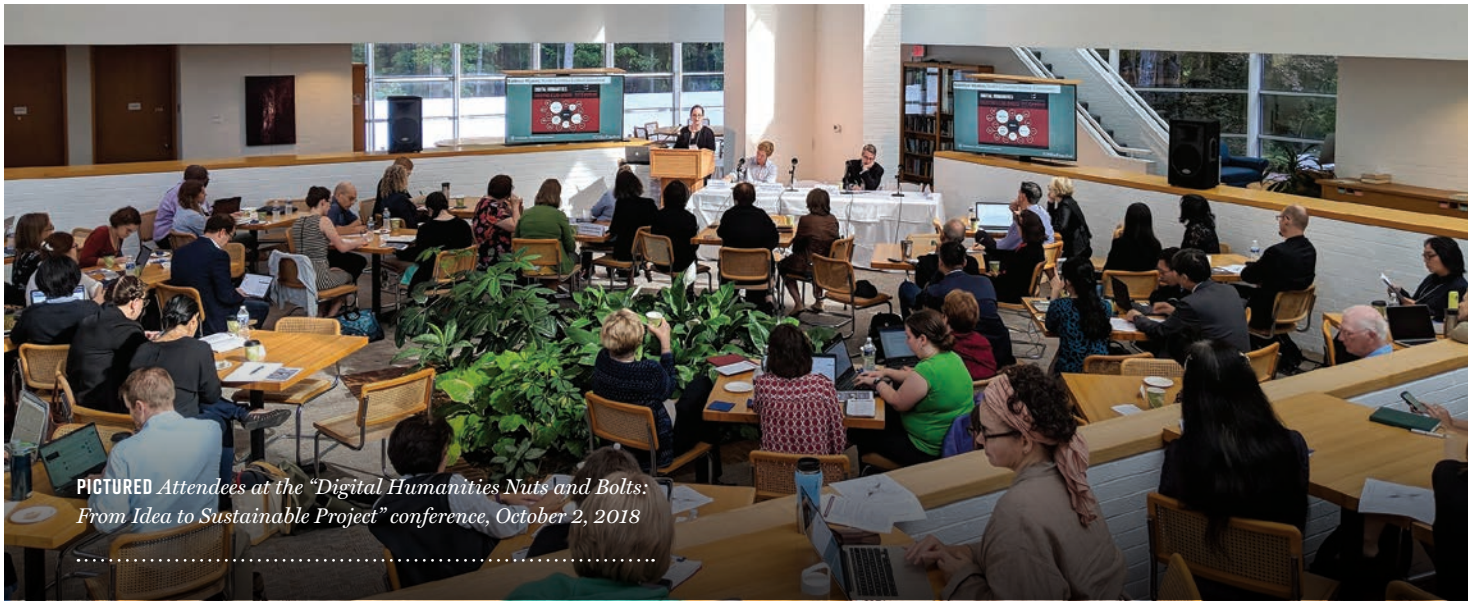
PICTURED Attendees at the “Digital Humanities Nuts and Bolts: From Idea to Sustainable Project” conference, October 2, 2018