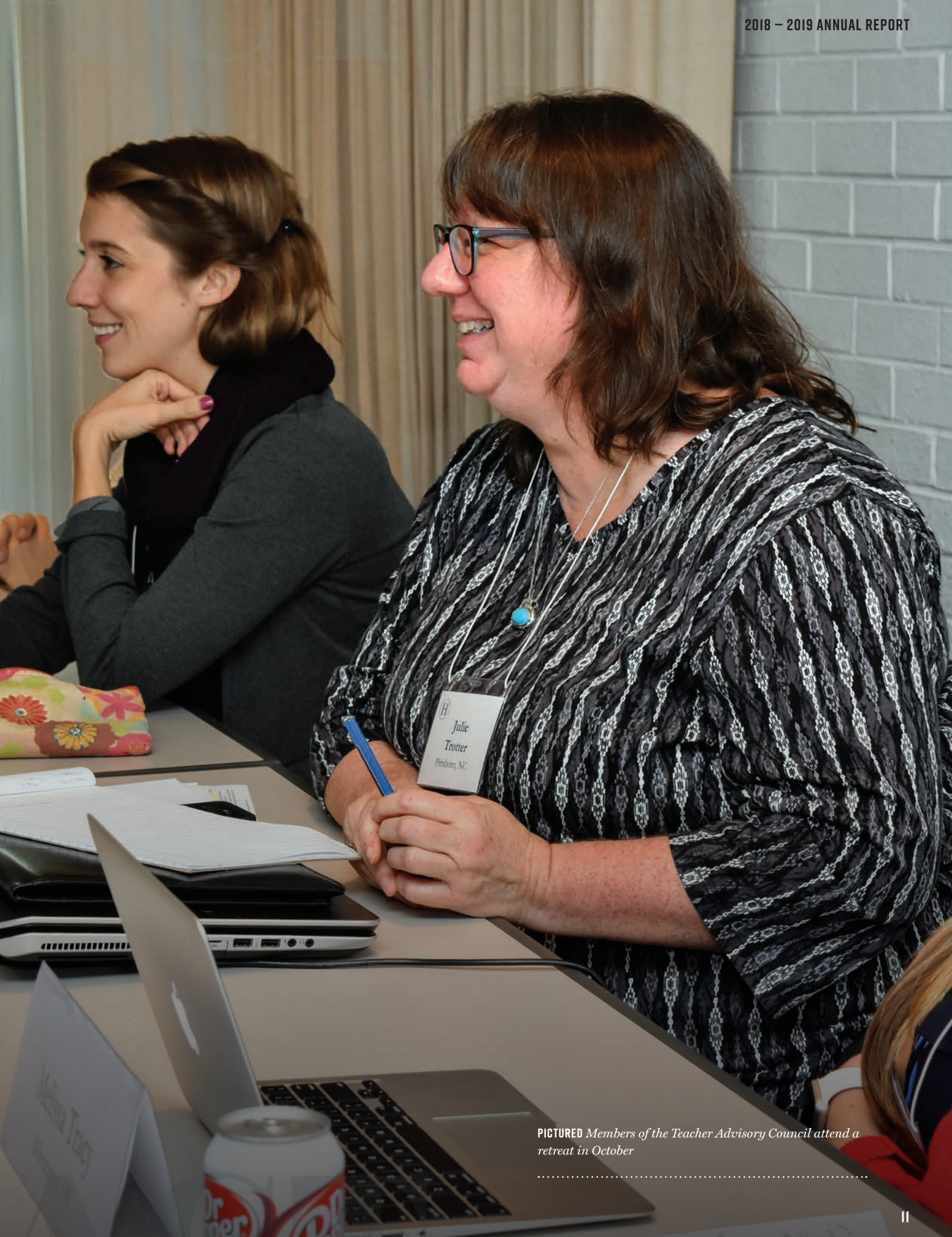
PICTURED Members of the Teacher Advisory Council attend a retreat in October