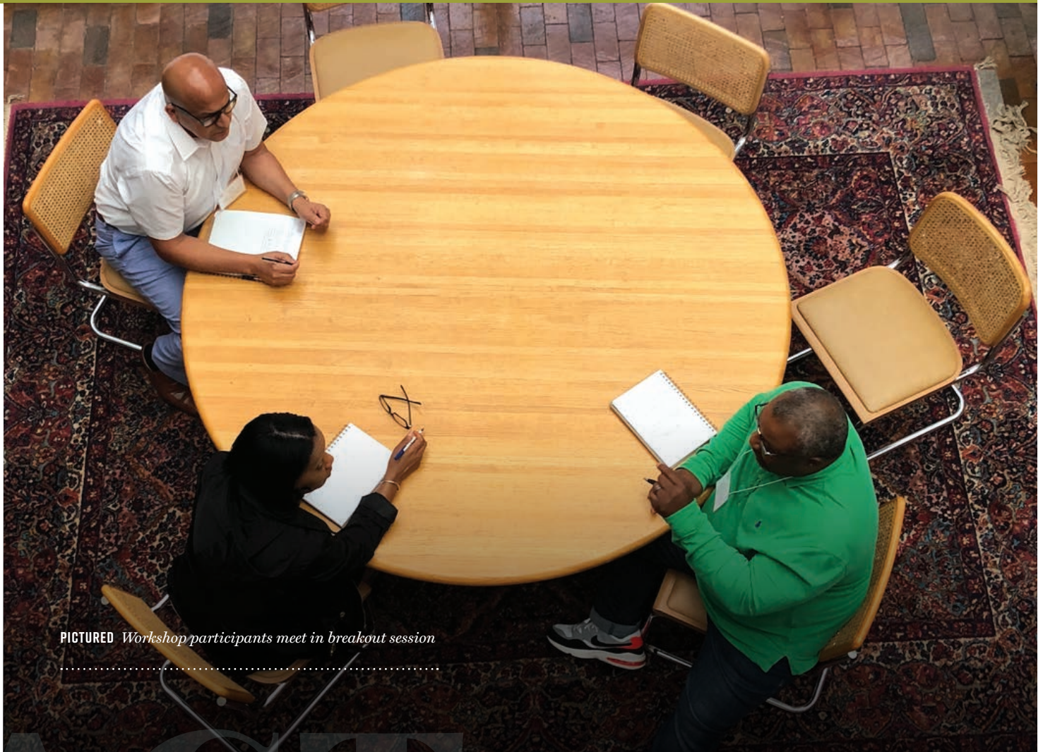
PICTURED Workshop participants meet in breakout session